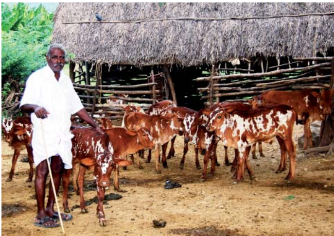
Bargur cattle breeder showing his calves

This protocol was established by a sub-group of the Lingayat, a large community in southern India, which lives in the Bargur Forest Range in the Western Ghats in Erode District of Tamil Nadu. They number an estimated 10,000 people and raise a unique cattle breed named Bargur or Barghur, besides managing the local forests. They also have detailed knowledge about ethnoveterinary practices. Their cattle-keeping practices are imbued with ritual meaning. For instance, they believe in giving one day rest to the animals per week and do not milk the cows on Monday, nor use the bullocks for ploughing on that day. In each herd, a couple of animals are devoted to God Matheswaraswmi and are maintained until they die a natural death. The Lingayat report a dramatic reduction of the Bargur cattle population over the last 10 years, so that now it numbers only about 2,500 head. They feel threatened by the expansion of the elephant population which destroys their crops. Other challenges are the spread of poisonous Lantana plant as well as closure of the forests by the Forest Department. Their biocultural community protocol was established in September 2009 (Samburu Local Livestock Keepers. 2010).