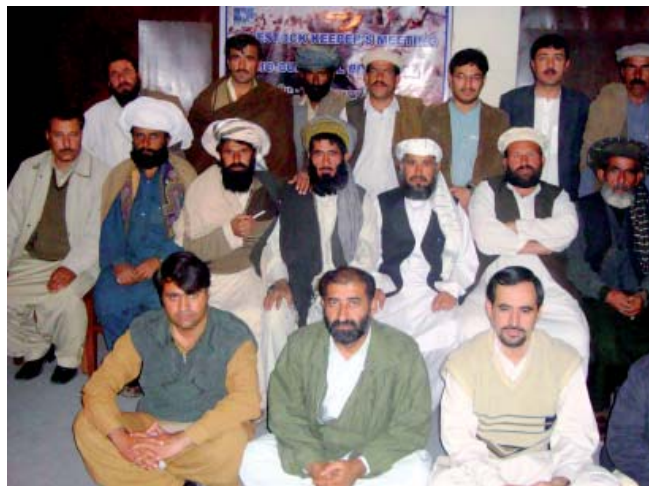
Participants in the meeting to develop the Pashtoon Biocultural Community protocol

The protocol provides interesting insights into the traditional rules by which access to resources was regulated. For instance, pastoralists from Afghanistan travelling through the area on a seasonal basis have the right of passage and can spend three days in one place, but are not allowed to establish permanent dwellings. There are also traditional community conserved areas known as pargorr (Pashtoon, 2010).