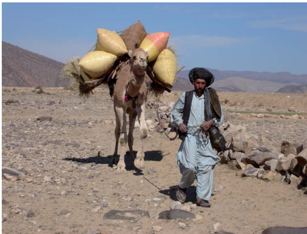
Pashtoon camel nomad in Baluchistan

All this said and done, biocultural community protocols are a new tool, and there is still much room for improvement and experimentation. Their misuse has to be prevented and it has to be ensured that it is communities who are driving the process. We need a dialogue between communities and outside actors to further improve the process and the relevance of biocultural community protocols.