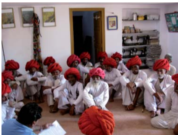
Establishing the Raika Biocultural Community Protocol

The Raika are the largest pastoral community of western Rajasthan. They have a close relationship with the camel, but have also developed a spectrum of other livestock breeds, including cattle, sheep and goats. As long as common property resources were amply available, the Raika felt strong and well-endowed. Historically, they also had a close relationship with the ruling class of Rajputs, for whom they took care of camel breeding herds and enjoyed grazing privileges in forests. But over the last 60 years, they have suffered from a host of developments that have eroded common property resources and restricted their access to the remaining areas, including intensification of crop cultivation, establishment of wildlife sanctuaries, population pressure, roads, enclosures of land, and many others.