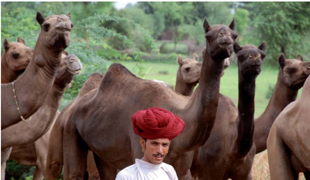
Young Raika camel herder in Rajasthan, India

L IVESTOCK KEEPERS' RIGHTS are a concept that dates back to the Forum on Food Sovereignty in 2002 (Köhler-Rollefson et al., 2008). The term is an allusion to the "Farmers' Rights" enshrined in the International Treaty on Plant Genetic Resources for Food and Agriculture. (source FAO, 2001) Initially an effort to achieve formal recognition for livestock keepers around the world as creators and custodians of animal genetic resources, the concept has since been fleshed out at a series of consultations with livestock keepers and has come to include a bundle of rights that includes rights to grazing, water, markets, training and capacity building, and participation in research design and policy-making, as well as rights to the genetic resources of their animals (Köhler-Rollefson et al., in press). It was recognized that curbed access to pasture resources, as well as the stigma often attached to traditional lifestyles based on mobile herding was one of the main drivers for the unraveling of pastoralist systems and the breeds on which they depend.