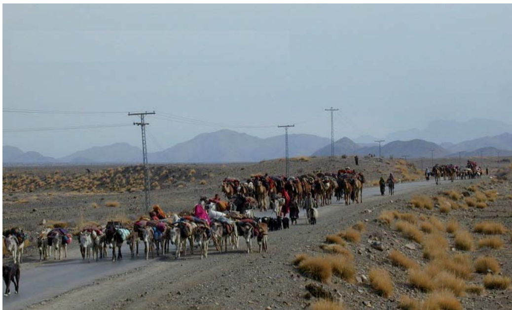
Pashtoon nomads on long-distance migration in Pakistan

Biocultural community protocols change the outside perception of breeds by putting the people and communities that have nursed them centre-stage. In essence, they transform “genetic resources” that seemingly exist in a social void – and belong to nobody particular – into the heritage or property of specific communities and flag them as the products of traditional knowledge of these communities. They firmly establish pastoralists and other traditional livestock keepers as indigenous and local communities embodying traditional lifestyles relevant for the conservation and sustainable use of biological diversity that are entitled to certain rights under the Convention on Biological Diversity. Protocols provide insight into the problems and constraints facing the breed and identify the people who are in the best position to tackle them. Biocultural community protocols make visible the ways of life, practices and situation of livestock keepers and thereby provide an entry-point for the in-situ and community-based conservation of breeds.