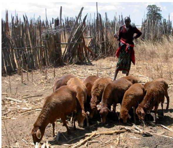
After preparing their biocultural protocol, the Samburu decided to revive the drought-resistant Red Maasai sheep

The Red Maasai sheep is a fat-tailed hair sheep and has a unique genetic capability to cope with internal parasites, especially Haemonchus contortus . This has attracted the attention of scientists as far away as Australia who are keen to understand the genetic basis of this trait which has obvious commercial potential. Despite this interest, the survival of the Red