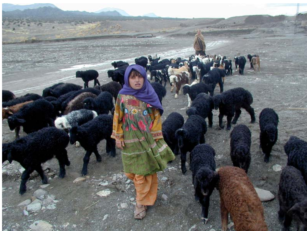
Pashtoon girl herding sheep

A printed protocol represents a potent tool for asserting rights. According to Raika leaders who were summoned to Delhi by the Central Empowered Committee for a hearing about their customary grazing rights in the Kumbalgarh Sanctuary, having the printed document that referenced all relevant laws and legal frameworks provided them with self-confidence and put them into a stronger bargaining position with the lawyers. For the Bargur cattle breeders, the biocultural community protocol may prove an important tool for regaining their penning rights in the forest.