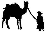
Lokhit Pashu-Palak Sansthan