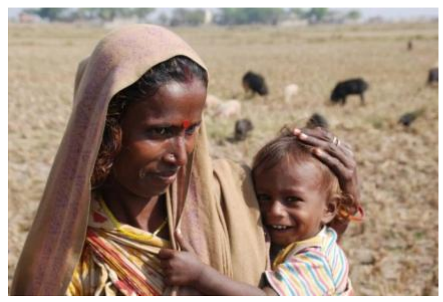
This youngster could not stop smiling!

of his introduced us to the pig keepers which were grazing their animals on the harvested paddy fields near Patamundai. Initially they were quite guarded, although one of youngsters carried around by his mother just could not stop smiling. Once we sat down, the leader of the group impressed us with his pointed and accurate information. His began with the remark that his pigs were entirely healthy and that this had been confirmed by the veterinary department. Apparently he had had some problems during the (human) swine flu outbreak when some people considered the pigs dangerous and