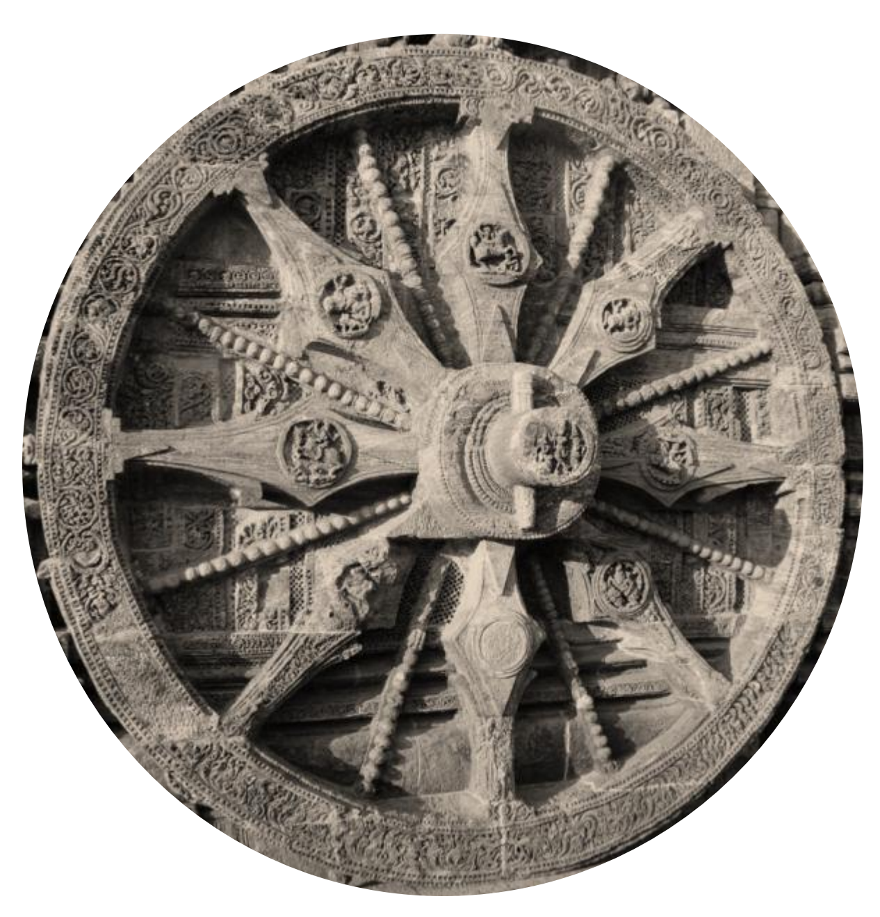
Chariot wheel of the Sun temple in Konark, Orissa