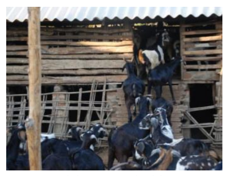
Upper storey goat shed – manure accumulates below