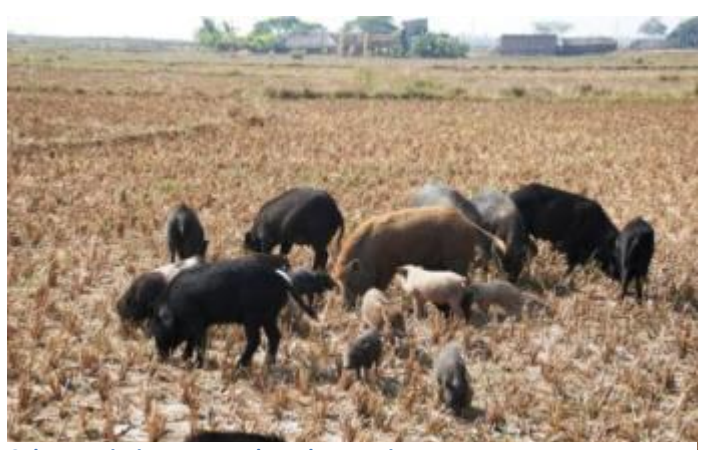
Colour variation among these happy pigs