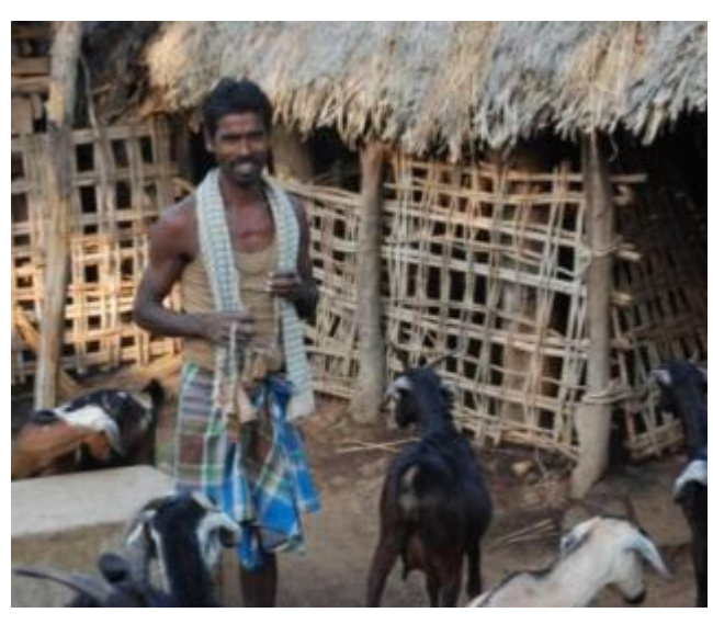
One of the two goat herds with wooden bells in his hand

These are some rules written on the wall of the communal building. One of them says to "graze the forest, but don't destroy it!"