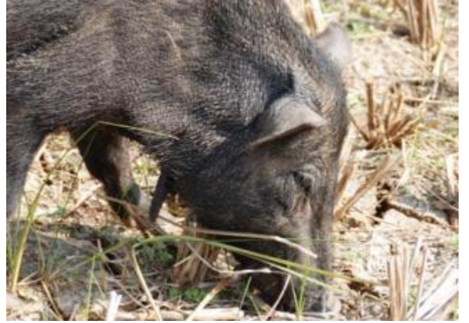
Gilla pig (wattled) 1