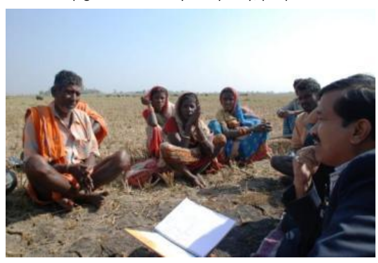
The leader of the pig herders

One interesting feature I noted were that many of the lead the pigs had wattles which I had thought only occurred in goats. This breed or type of pig is called "gilla".