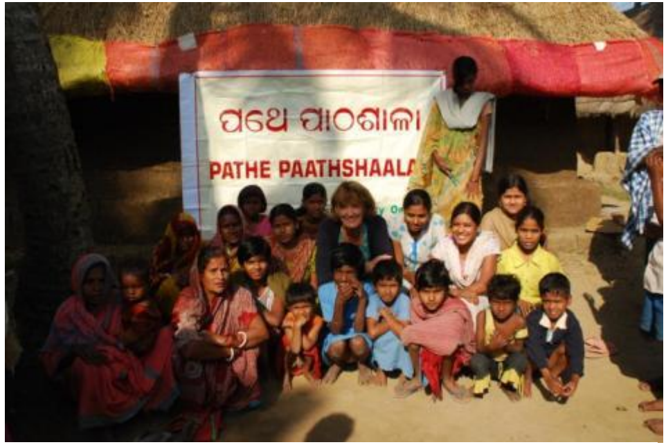
After the pathshala session, the women demanded a photo with me.

The ducks do not hatch their offspring, for this the people deploy a broody hen. They also showed me some naked head chicks which they had obtained from Bhadrak and they said were coming from China.