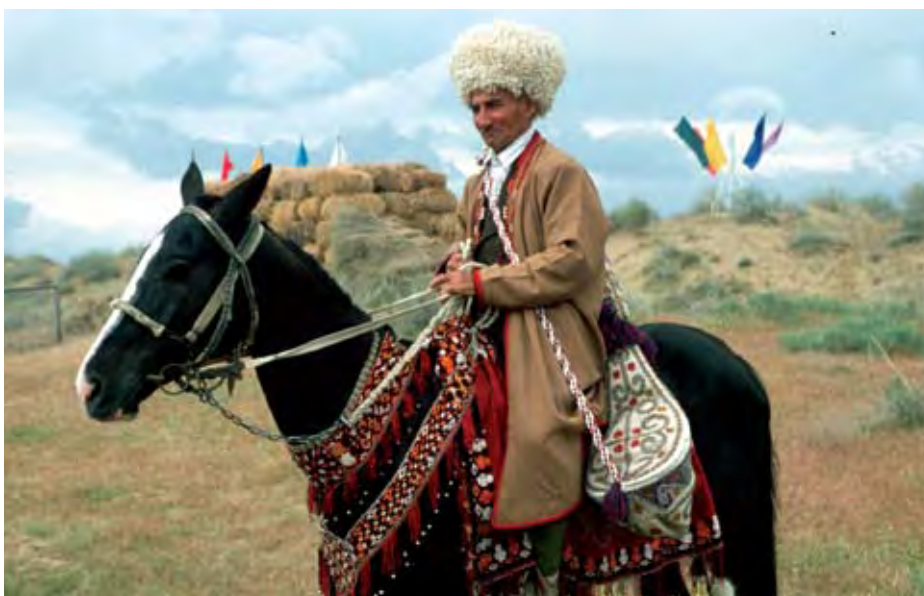
Horse breeding is central to the culture of the inhabitants of the steppe in Turkmenistan