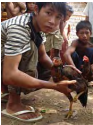
Indigenous chickens are important in the rural economy of Cambodia