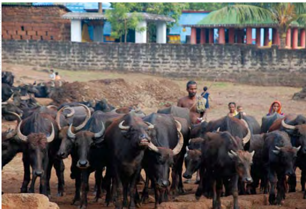
The Chilika buffalo is important for people's livelihoods and as part of the Chilika lake ecosystem in Orissa, India