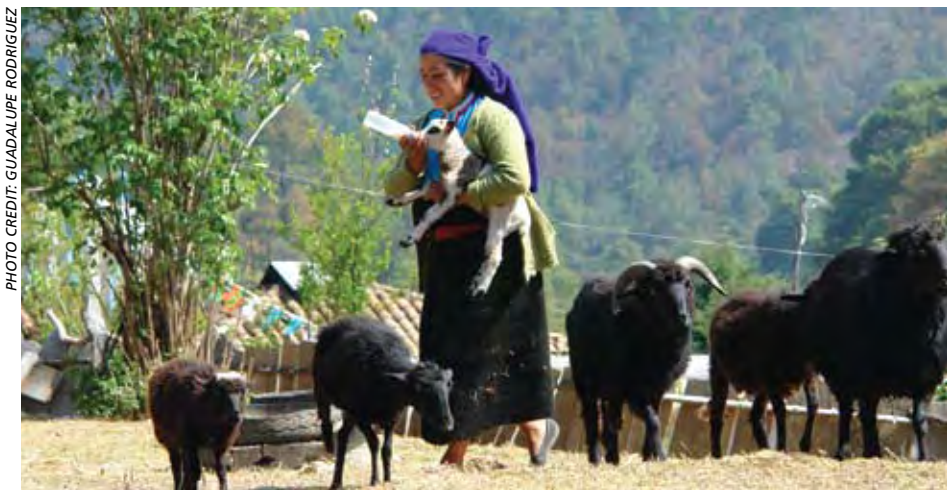
Tzotzil sheperdesses in Mexico breed and take care of their black sheep breed

Smallholder farmers and pastoralists are rarely represented in national and international decision-making bodies and can voice their concerns only with the help of outsiders. But as they are guardians of the breeds to be conserved, it is crucial these livestock keepers be given a voice in policy-making.