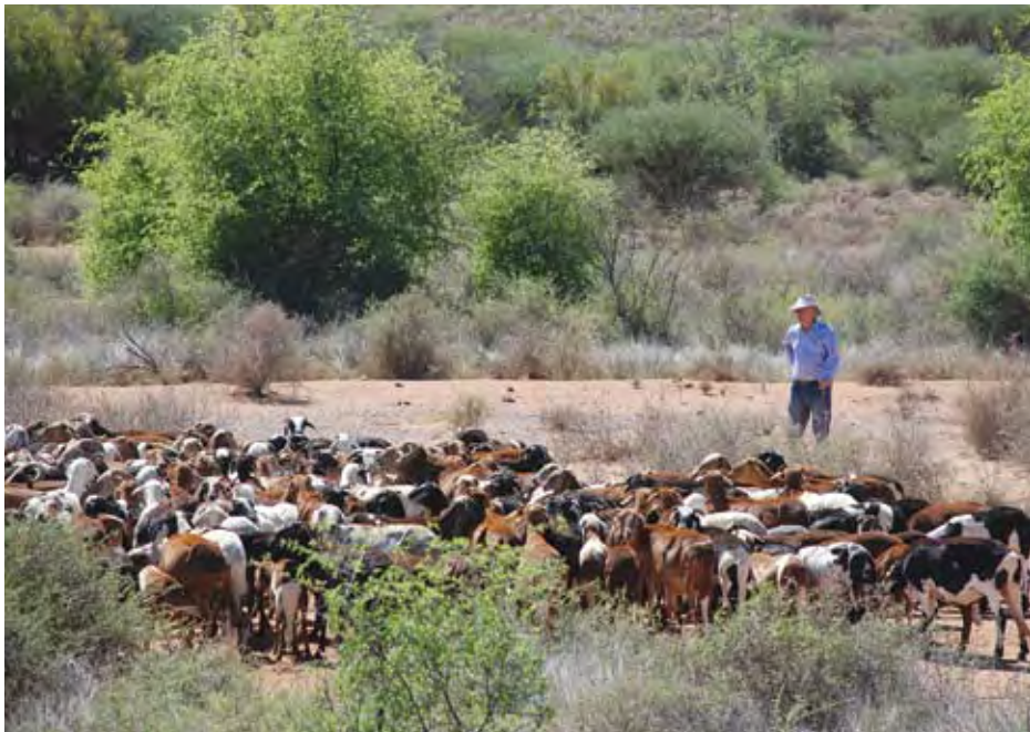
The Damara sheep were originally developed by the Himba pastoralists, but are now popular with farmers in South Africa