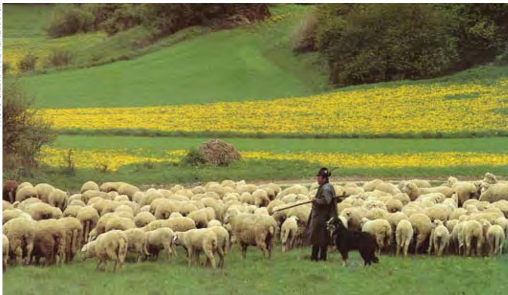
Sheep flocks have become important for landscape and biodiversity conservation in Germany