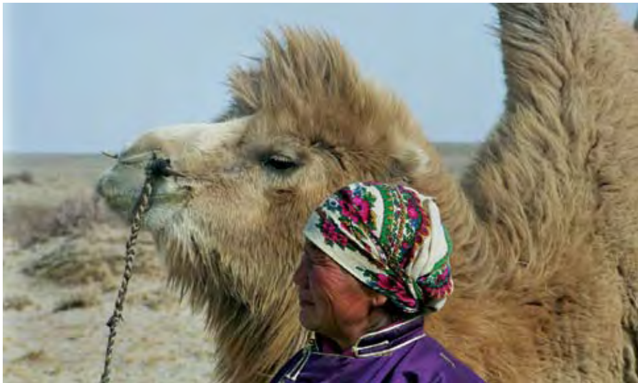
The Bactrian camels of the Gobi desert in Mongolia provide wool, transport, milk and meat

“feeding competence”, defined as the ability to select the best season-specific browse or graze, and the ability to negotiate difficult terrain. The capacity to browse includes the ability to reach, choose, ingest and process the highly nutritious forage that their herders lead them to. The WoDaaBe also select their animals for “social competence”, in order to minimize stress in interactions within the herd and with the herder (Krätli, 2008).