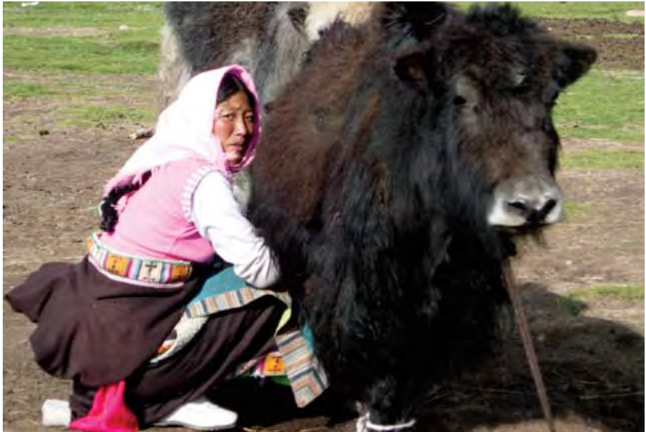
The yak is important to the livelihoods of the inhabitants of the Tibetan plateau in China

Most breeding programmes aimed at improving the productivity of indigenous chickens have used cross-breeding. This approach has provided significantly higher productivity, but has resulted in a loss or dilution of the indigenous birds' morphological characters and instinct for broodiness. For example, the Sonali breed, developed in Bangladesh as a high-yielding breed for use in under semi-scavenging conditions, lost popularity among smallholders when they discovered that they had no success in reproducing it. Similarly in India, when villagers received cross-bred hens from a research institute, they expressed concerns about the dilution of morphological characters (Besbes, 2008).