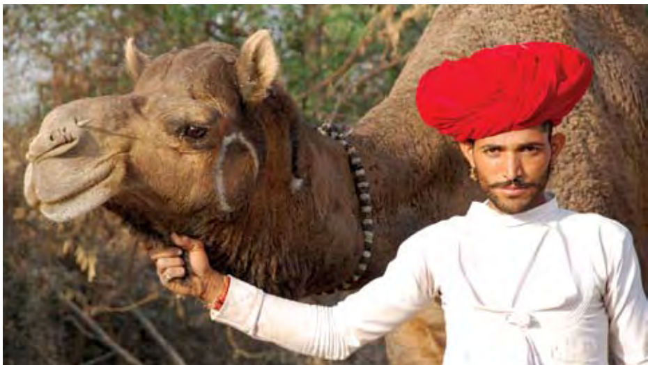
The Raika pastoralists are the custodians of the dromedary in Rajasthan, India