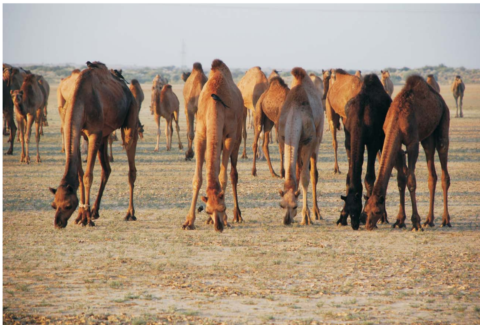
Camels can even exploit salt flats

– FAO Global Plan of Action on Animal Genetic Resources,