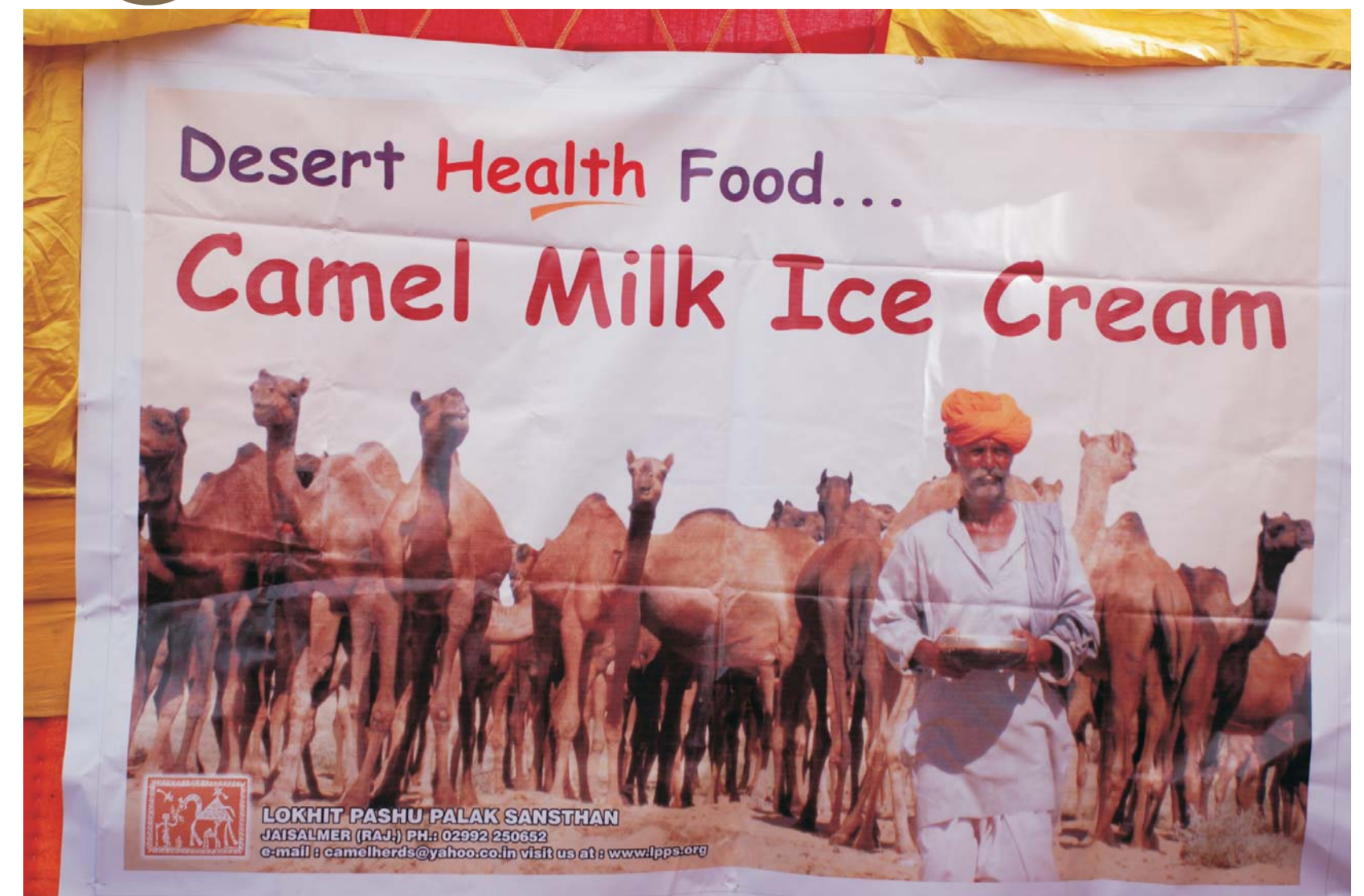
Educating consumers about camel milk ice cream