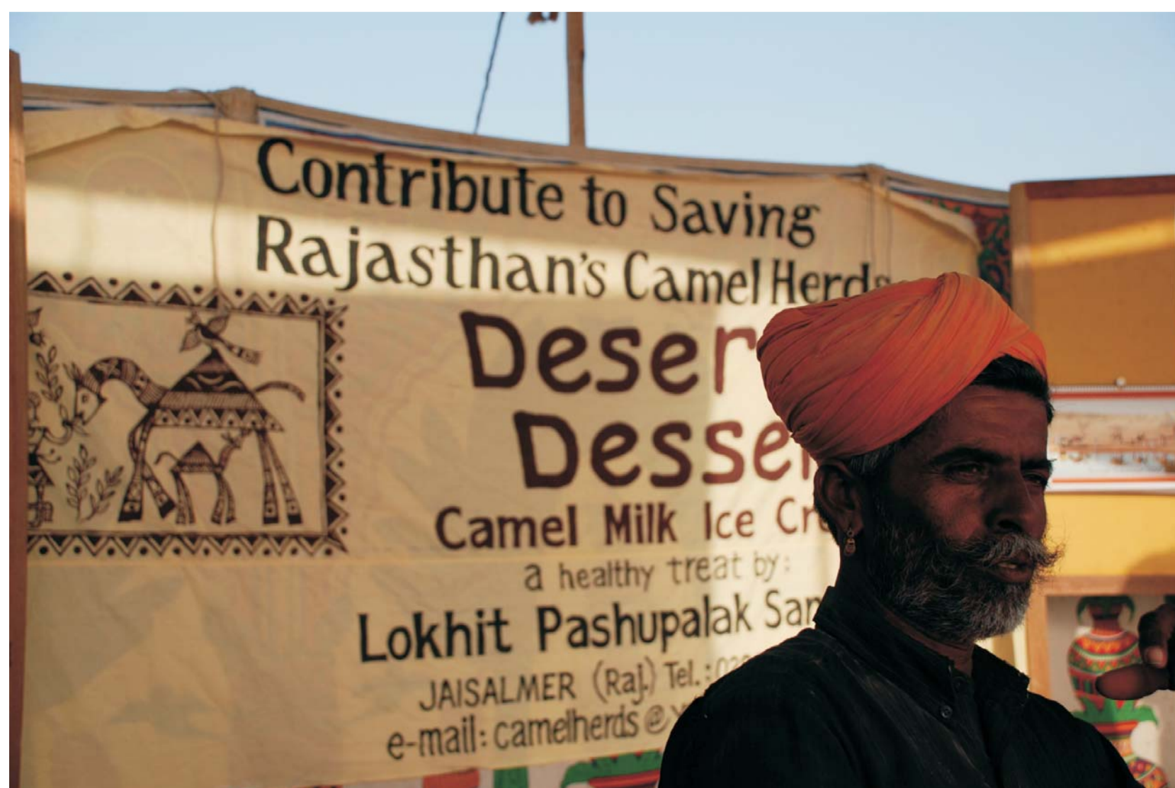
Educating pastoralists about the economic potential of their camels