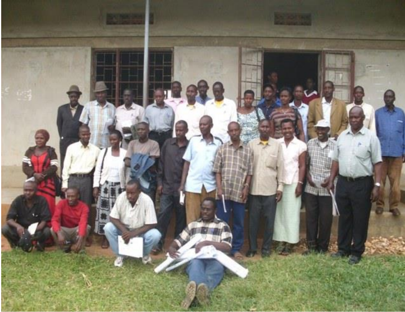
Abantu ababeire bari omurukiiko orwabeireho ebiro 5/3/09 aha gomborora ya Sanga, Nyabushozi, Kiruhura District