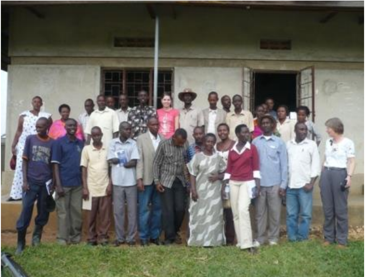
Abantu ababeire bari omurukiiko orwabeireho ebiro 4/3/09 aha gomborora ya Sanga, Nyabushozi, Kiruhura District