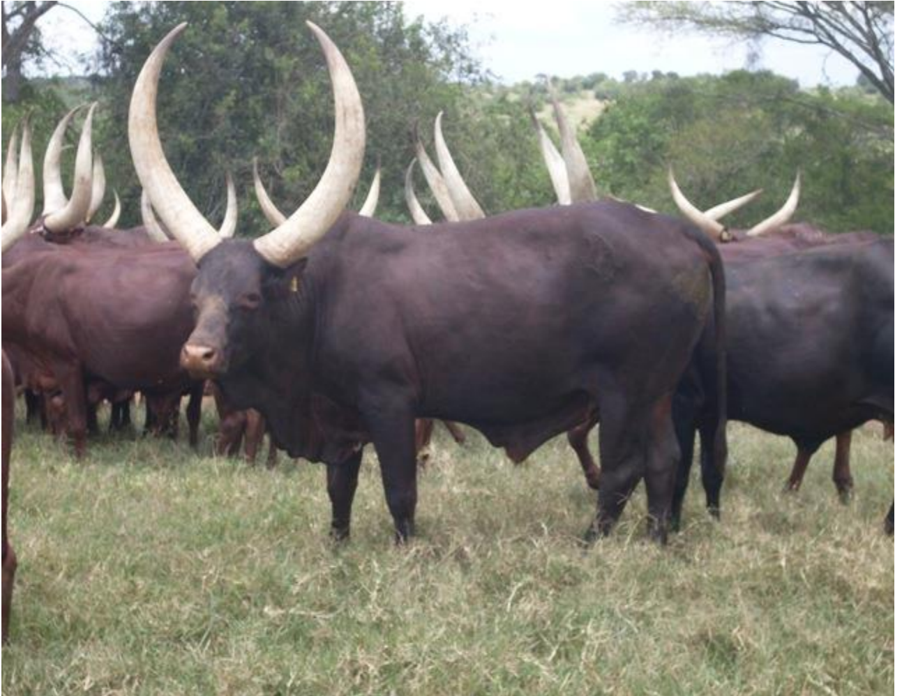
“Ruhogo” – Enimi nk’egi ninungi y’okubiikira