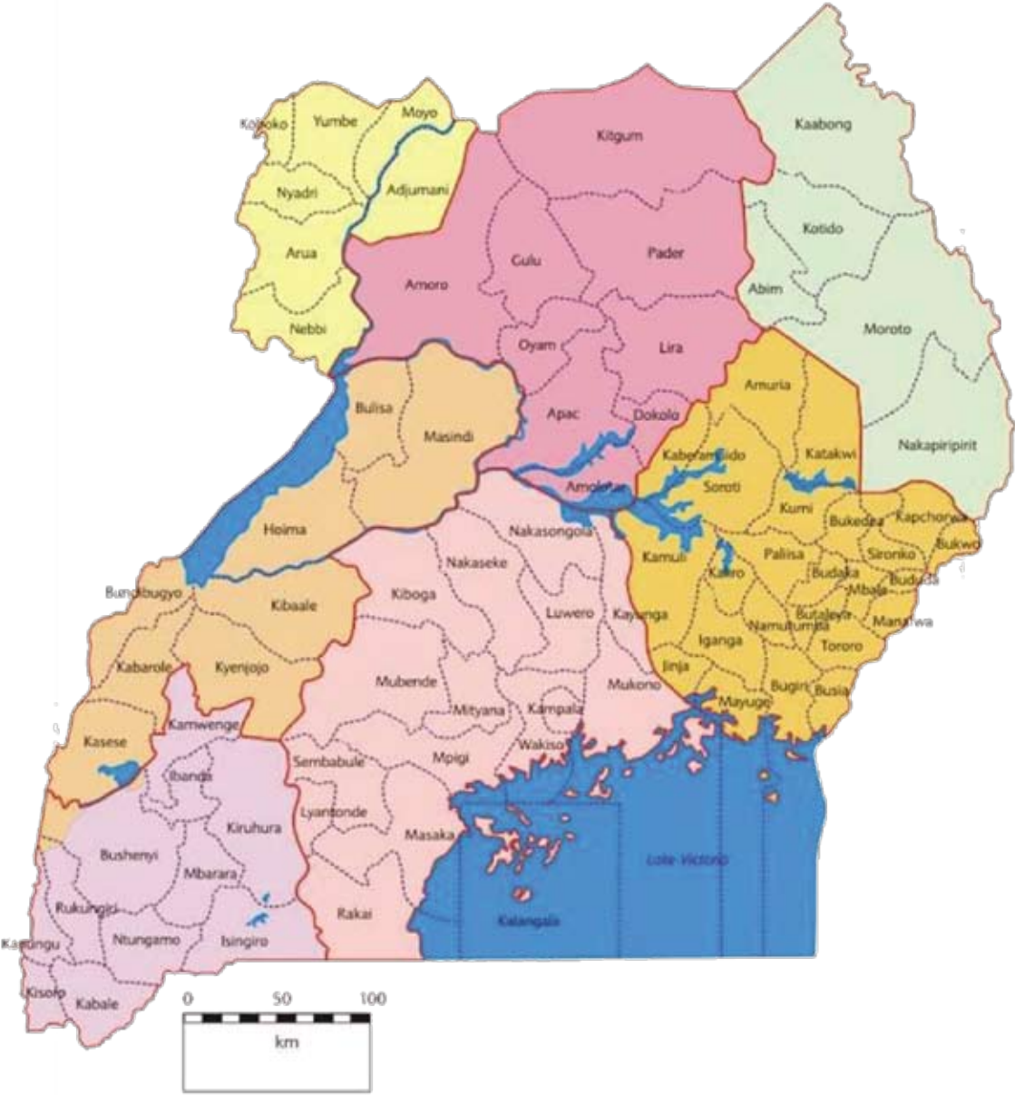
A map of Uganda showing Districts (Nkore region covered Bushenyi, Ibanda, Isingiro, Kiruhura, Mbarara, parts of Ntungamo and Rukungiri – refer to purple coloured area)

The best area for the Ankole cattle is "Nkore" or Ankole. We believe that Nyabushozi County in Kiruhura District (N.B. which is also found in "Nkore") is the best. However the Ankole cattle have done well in areas of Bukanga County in Isingiro District, Kashari in Mbarara (N.B. both these areas are found in "Nkore"). Kiboga District (found in Buganda region) and Masindi District found in Bunyoro region). Generally the Ankole cattle are surviving well in other low lying and sparsely populated areas. (The areas mentioned are all located in the cattle corridor of Uganda:transcriber's note).