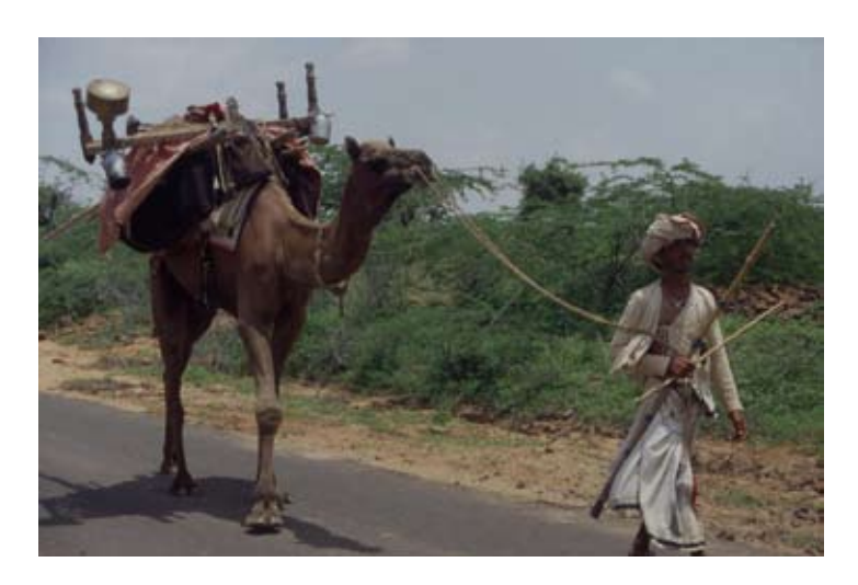
A Rebari camel-owner from Gujarat