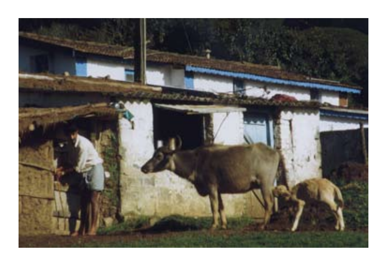
Toda buffalo breeder