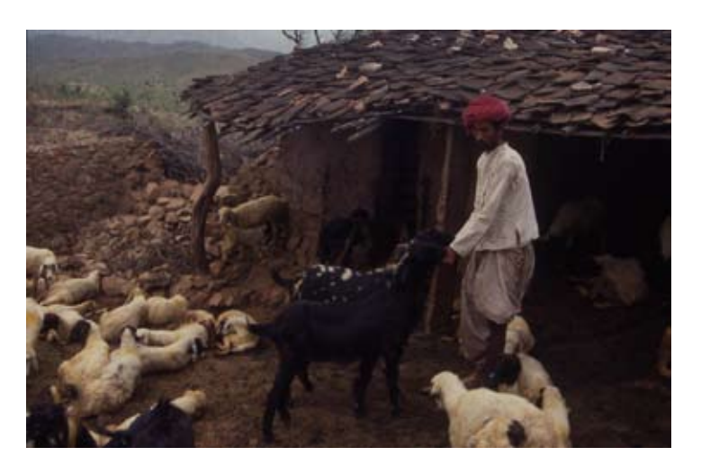
A Raika herder and his mixed herd