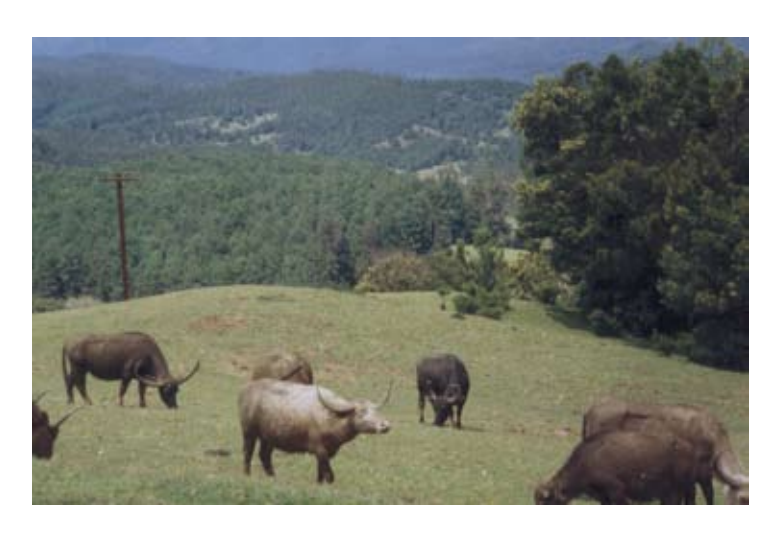
Open pasture land in the Nilgiri Hills where the Forest Department is trying to plant trees