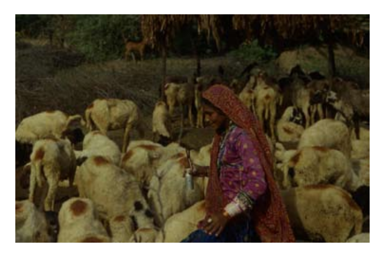
A Raika woman among her sheep