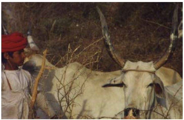
Nari cattle (undocumented breed)