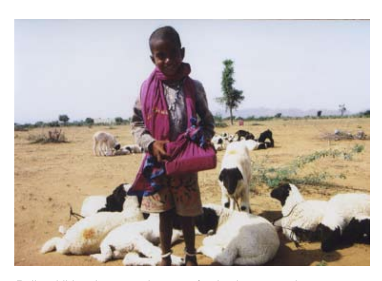
Raika children learn to take care of animals at an early age