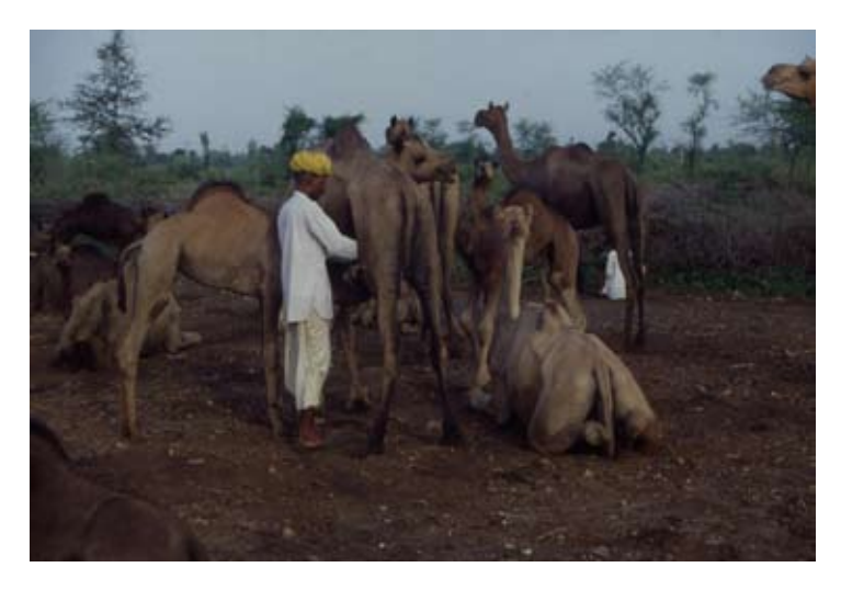
A Raika camel breeder milking his animals