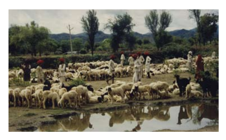
A Raika sheep flock migrating back home during the rainy season