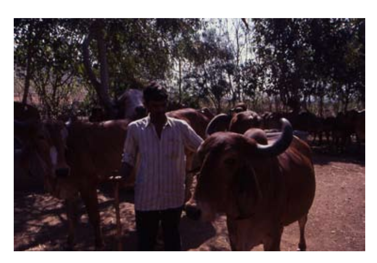
Gir cattle with their keeper