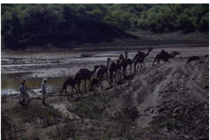
The Kumbalgarh Sanctuary in Rajasthan is a traditional grazing ground for Raika pastoralists