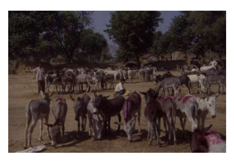
Donkeys – a neglected species