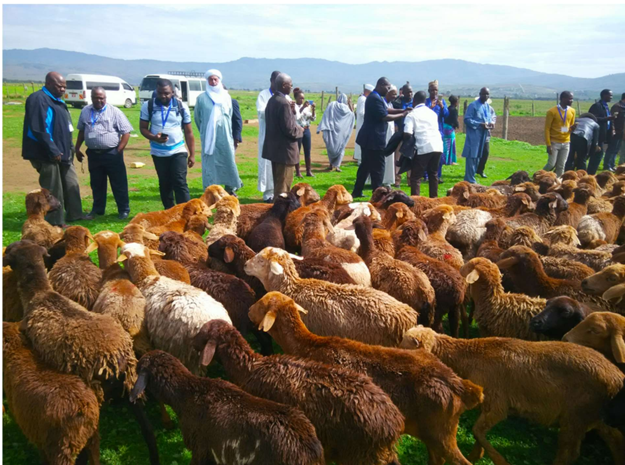
FIELDTRIP TO A FEMALE BREEDER OF RED MAASAI SHEEP AT THE CONCLUSION OF THE AU-IBAR WORKSHOP IN NAIVASHA