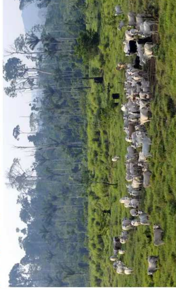
▲ Cattle at an illegal settlement in the Jamanxim National Forest, northern Brazil. The 1.3m hectare forest is today a microcosm of what happens in the Amazon, where vast areas of land are prey to illegal woodcutters, stock breeders and gold miners.

Biggest analysis to date reveals huge footprint of livestock - it provides just 18% of calories but takes up 83% of farmland