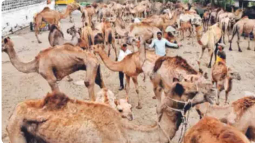
The camels are being checked by vets and will remain in Nashik till the investigation into why they were in the city is over

State releases water into Gangapur dam for Nashik