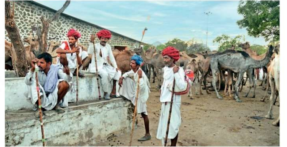
पंधरवड्यापासून मरुभूमीची ओढ लागलेल्या उंटांना त्या भूमीतील लोक पांजरापोळमध्ये नजरेस पडली अन् जणू त्यांच्या अंगात त्राण आले.